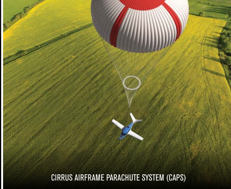
CIRRUS AIRFRAME PARACHUTE SYSTEM (CAPS)