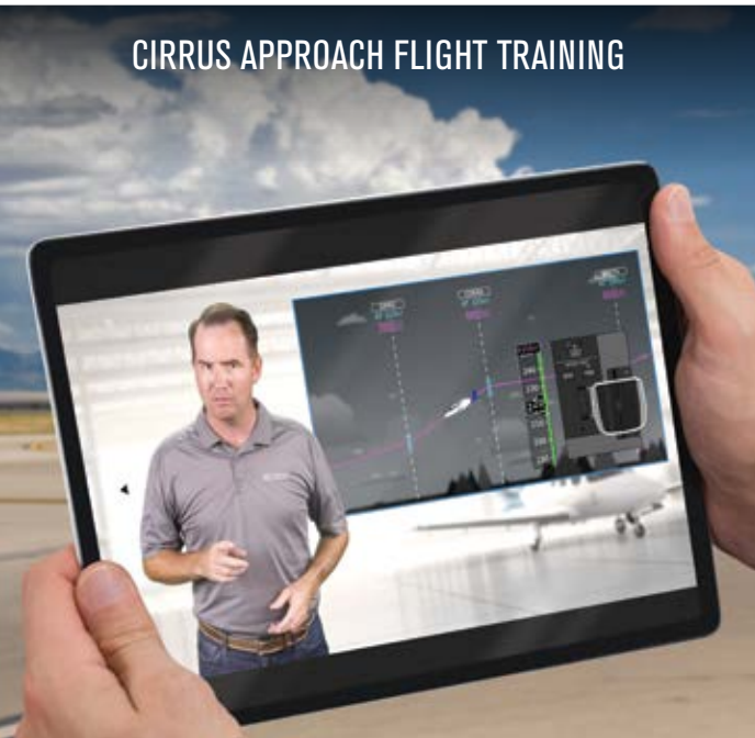
CIRRUS APPROACH FLIGHT TRAINING