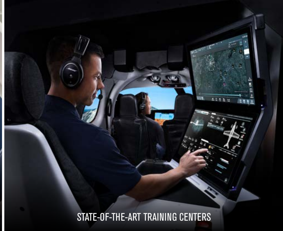
STATE-OF-THE-ART TRAINING CENTERS