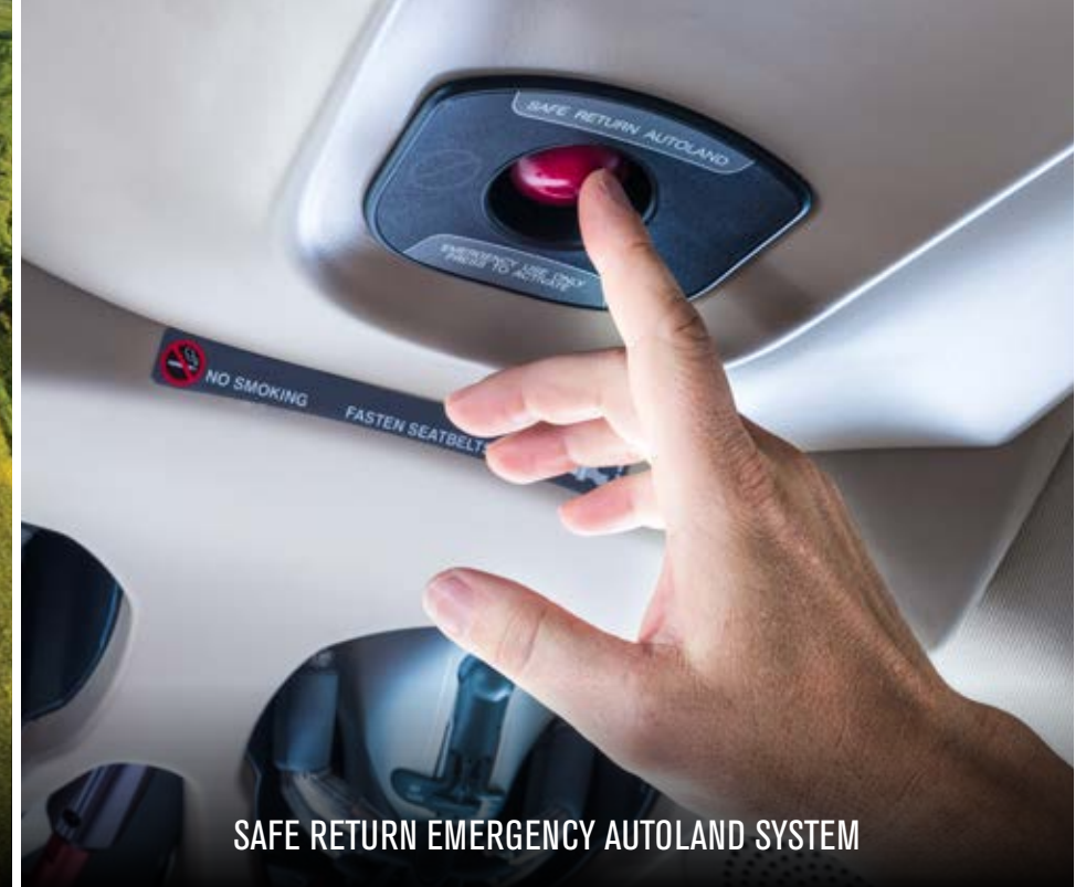
SAFE RETURN EMERGENCY AUTOLAND SYSTEM