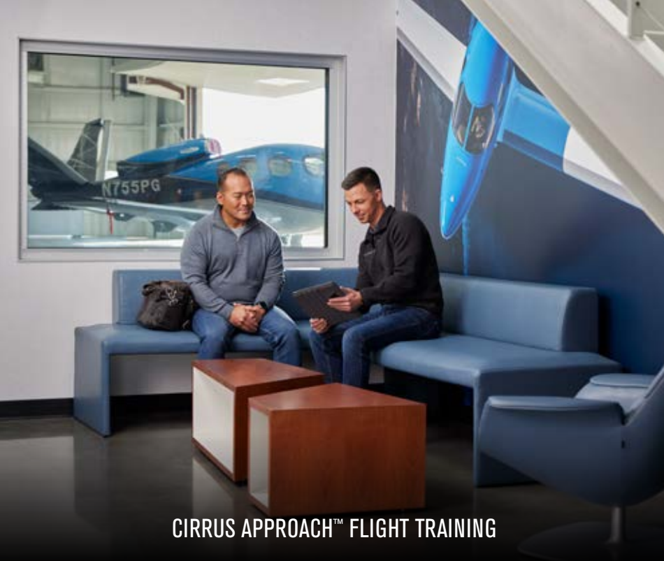
CIRRUS APPROACH™ FLIGHT TRAINING